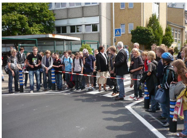
The opening of the infrastructure improvements at the secondary school in Bünde.

The town of Bünde is a member of the Association of Bike-friendly Cities, Towns and Counties in North Rhine-Westphalia (Arbeitsgemeinschaft fahrradfreundliche Städte, Gemeinden und Kreise in Nordrhein-Westfalen e.V.). ‘School and cycling’ has been a focus area since 2006. In 2007 a pupil survey was conducted to take stock of the means of transport being used by pupils to get to school. Pupils who cycle to school were also questioned about the hazard spots that they encounter along their routes. On the basis of this mobility survey, it was possible to implement various proposals for the optimisation of road infrastructure in cooperation with the police, municipality, school administration and teachers. For example, an electronic access-control system was added to the cycle-parking facility. Owing to the large number of bicycles around the school (accounting for 50% of pupils in the summer), the road on which the parking facility is located was transformed into a bicycle street with limited motor-vehicle traffic. These changes were communicated to motorists by pu-