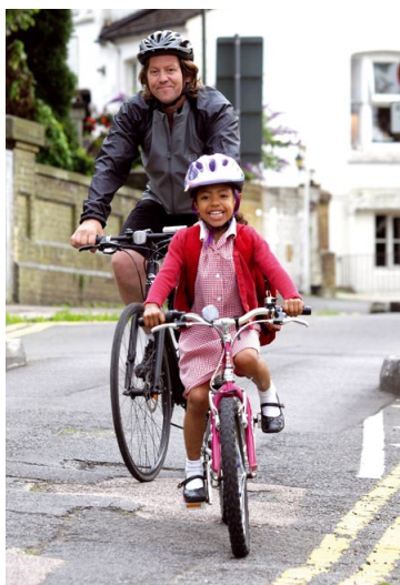
Bike It participant on her way to school.

Sustrans ( www.sustrans.org.uk ), the UK's leading sustainable transport charity, launched its "Bike It" project in the 2004-2005 school year. Through this project, pupils at participating schools and their parents are being introduced to cycling by expert "Bike It" officers. With its 60 employees, each of whom works intensively with between 10 and 12 schools throughout an academic year in the development and implementation of cycling-related projects, training and events with the help of local partners, "Bike It" is able to help children overcome their reservations about cycling, establish a local pro-cycling culture in each school community and more than double the number of pupils who cycle to school.